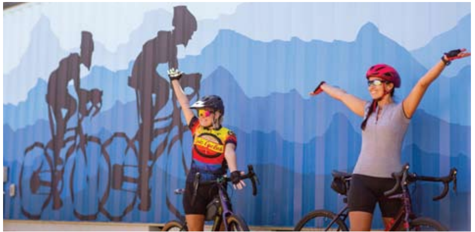
Cyclists in Old Fort