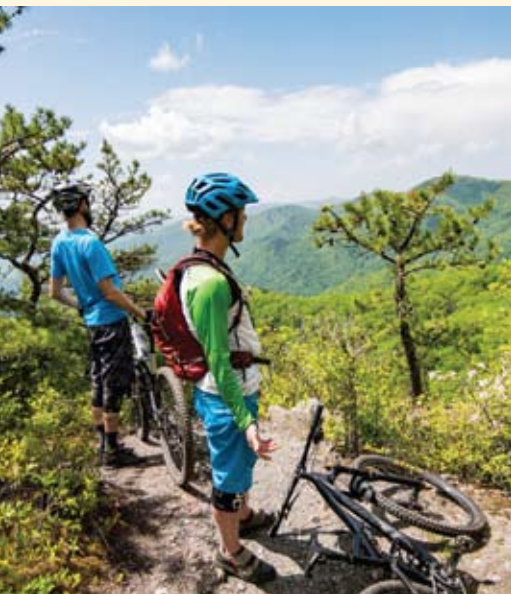
Woods Mountain Trail