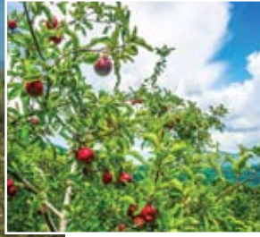
Apple trees in bloom