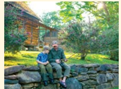
Preparing to fish in Mill Creek

Offers rental tubes and shuttle rides or bring your own tube on Greenlee Park where you'll find parking, picnic tables and river access. 828-442-6048