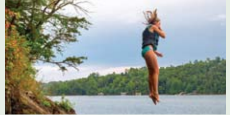
Jumping in to Lake James