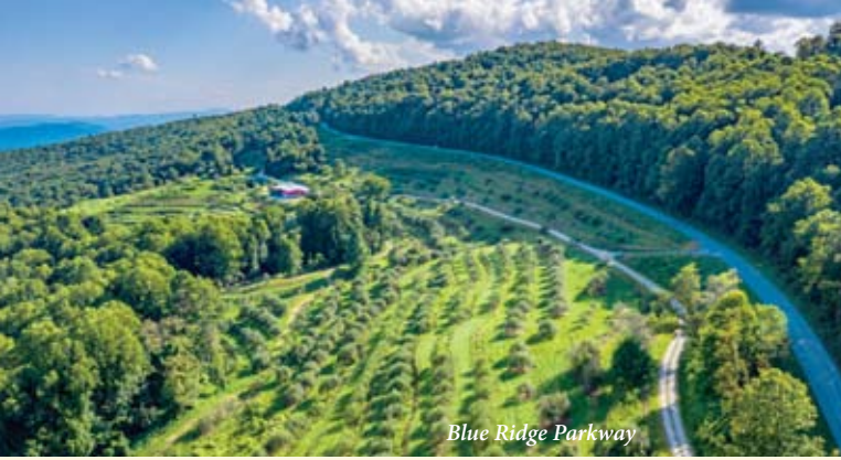
Blue Ridge Parkway