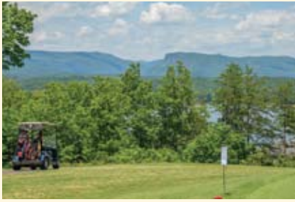
Golf course with beautiful views