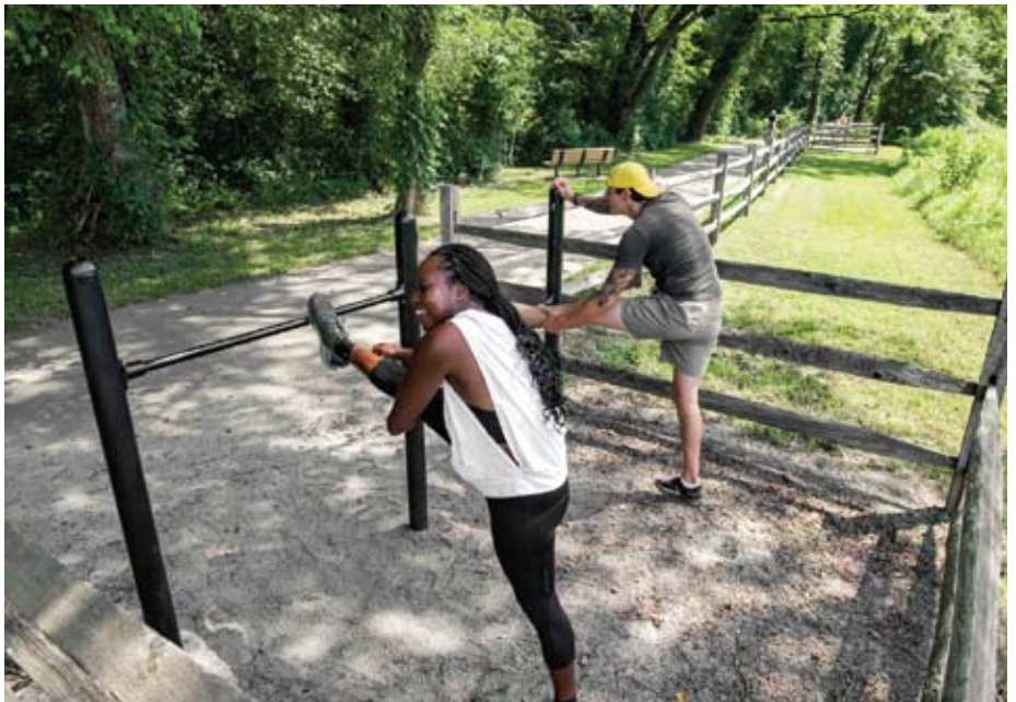
On the Greenway