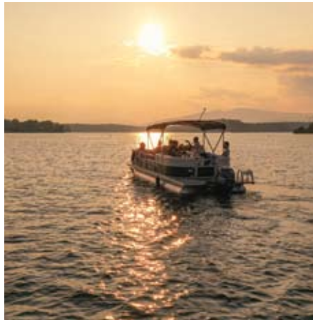
Boating on Lake James