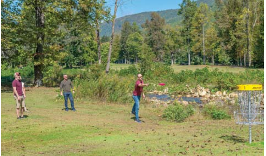
North Cove Disc Golf

Disc Golf and social club with 3 world-class courses meandering along the Catawba River in North Cove.