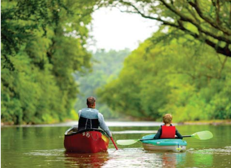
Catawba River at Phillips Landing

Make Marion your Main Street! Choose from cozy cabins and cottages to luxurious Lake James vacation rentals to your favorite national hoteliers.