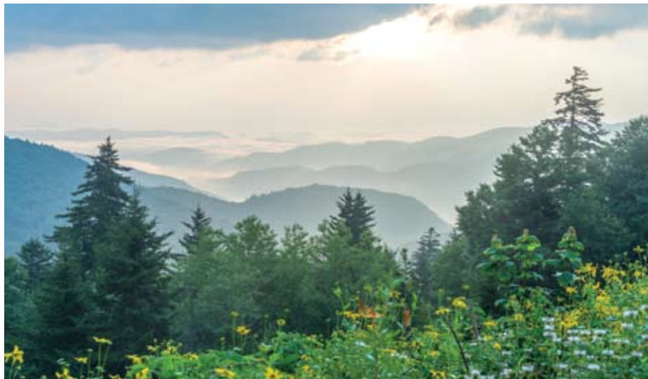
Blue Ridge Parkway

Within the National Park Service system, the Blue Ridge Parkway is one of the most visited parks. In our area, you have access to three entry points, NC Highway 80 (at the intersection of US 70), from downtown Marion US Highway 221N, and US Highway 226N. A local and visitor favorite, you'll find the seasonal community of Little Switzerland between two favorite waterfalls, Crabtree and Linville at Milepost 334.