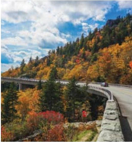
Blue Ridge Parkway