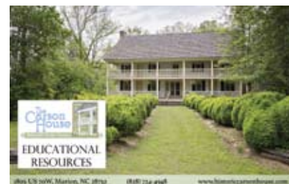
The Historic Carson House