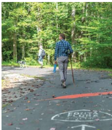
Point Lookout Trail

Hike or bike this 26-mile loop. Not for the faint of heart! Rollercoaster climbs with epic descents.