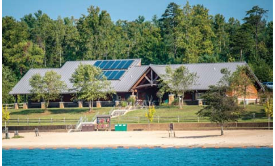
Lake James State Park at Paddy's Creek