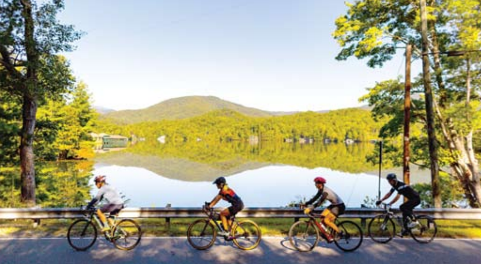
Cycling at Lake Tahoe