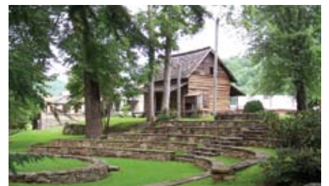
Mountain Gateway Museum