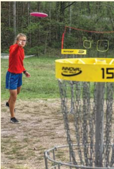
Disc Golf at North Cove Leisure Club

Looking for more time outdoors? Practice your disc golf game, book a tee time at the North Cove Leisure Club and Disc Golf Course. This 157-acre property includes two challenging courses and is a short drive to Linville Caverns and the Blue Ridge Parkway. If disc golf isn't for you, hit the links at Marion Lake Club. This public course is the only golf course with views of spectacular Lake James. Both courses include onsite bar and grill service.