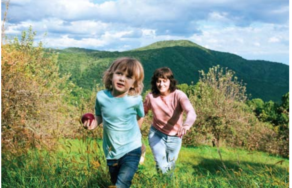
Orchard at Altapass

The 100+ year old Orchard at Altapass opens to views of the famous Clinchfield Loops. Visitors from across the globe travel to view this engineering marvel created by the Carolina Clinchfield and Ohio Railway.