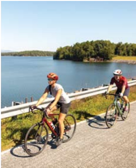
Ride at Lake James

The Catawba River area features easier hiking trails. The old growth forest canopy keeps you cool during summer weather. Amenities at both parks include picnic tables and restrooms.