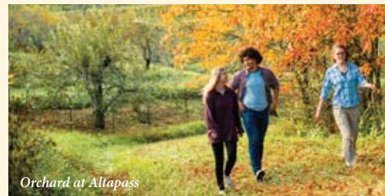
Orchard at Altapass