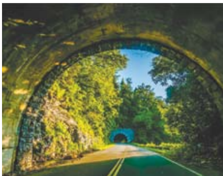
Blue Ridge Parkway

190 curves covering 12 miles of two-lane blacktop. Take home DiamondbackNC swag, locally crafted glassworks, jewelry, and more when you visit the shops at the Switzerland Inn.