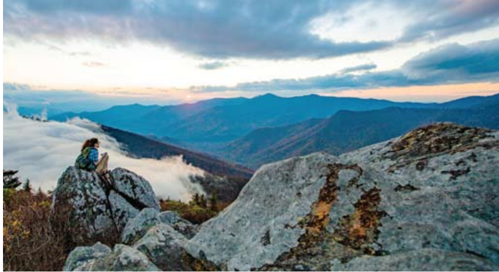
Sunset in the Blue Ridge mountains