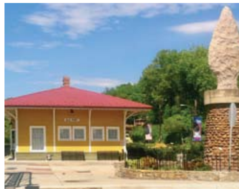
Old Fort Depot

(back road bicycle ride), and the mountain bike races including the Off-Road Assault on Mt. Mitchell, the Jerdon Mountain Challenge, and the Pisgah Enduro Race.