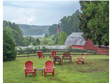
South Creek Winery and Vineyard