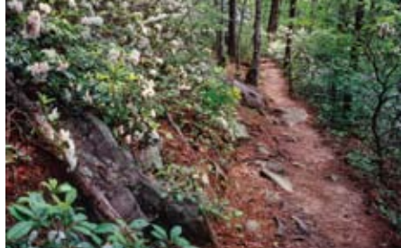
Miles of hiking trails

Schedule a tee time at North Cove Leisure Club and Disc Golf Course or the Marion Lake Golf Club.