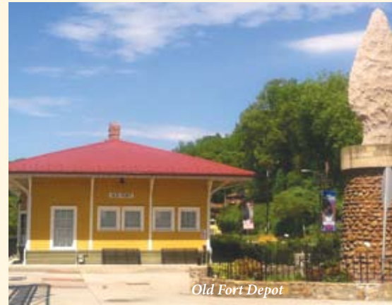
Old Fort Depot