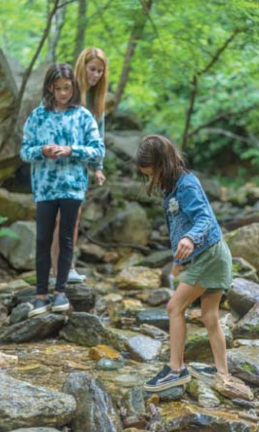
Exploring the creeks