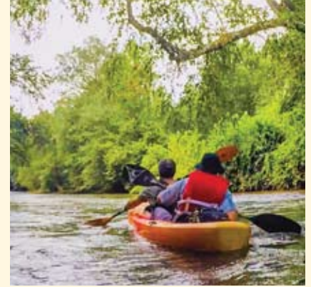
Kayaking on the Catawba River