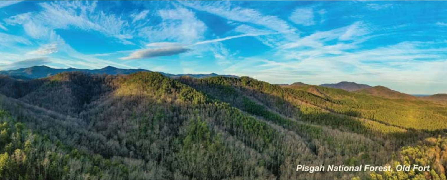
Pisgah National Forest, Old Fort