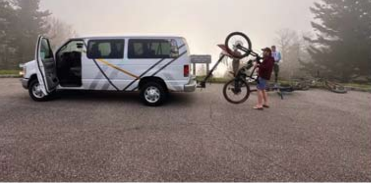
Mountain Top Shuttles