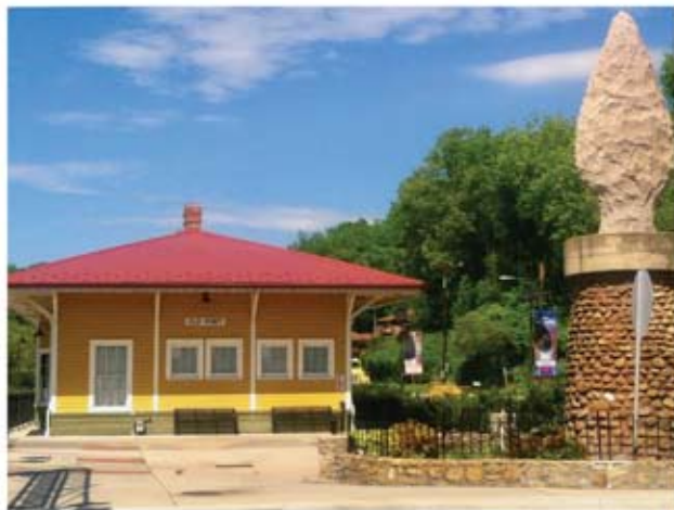
Old Fort Train Depot and Arrowhead

Welcome to Old Fort, North Carolina! Officially designated Old Fort in 1873, our small mountain town has grown to reflect the enduring spirit of artists, farmers, heritage craftsmen, entrepreneurs, outdoor recreation enthusiasts, and those passionate about our beautiful natural surroundings. Come experience the charm of our growing downtown streetscape, filled with enticing local dining and iconic murals painted by renowned artists. Or, immerse yourself in Pisgah National Forest with our unparalleled trail networks.