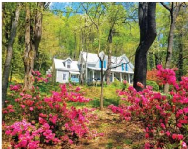
Below: Mountain Appalachian Inn