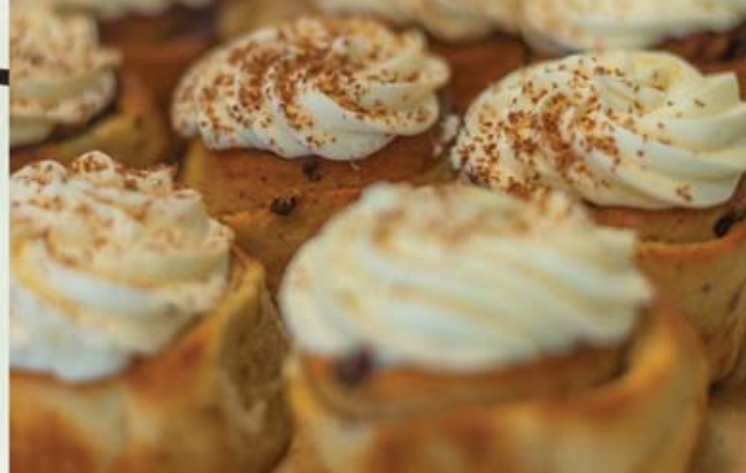
Go-Go's handmade Pumpkin Spice buns.