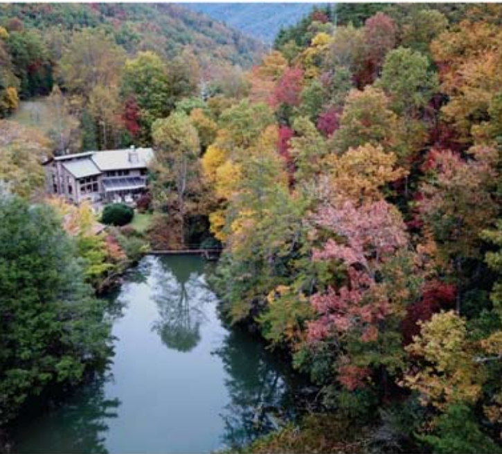
Above: Inn on Mill Creek